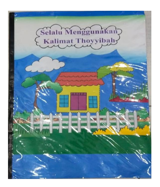
Figure 3. Contents of Islamic Big Book